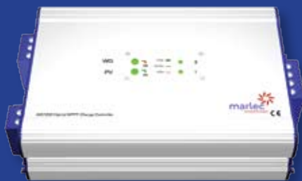
Dims: 258x164x68mm 1.3kg 10x6 \frac{1}{8} x2 \frac{3}{4} 2.9lbs